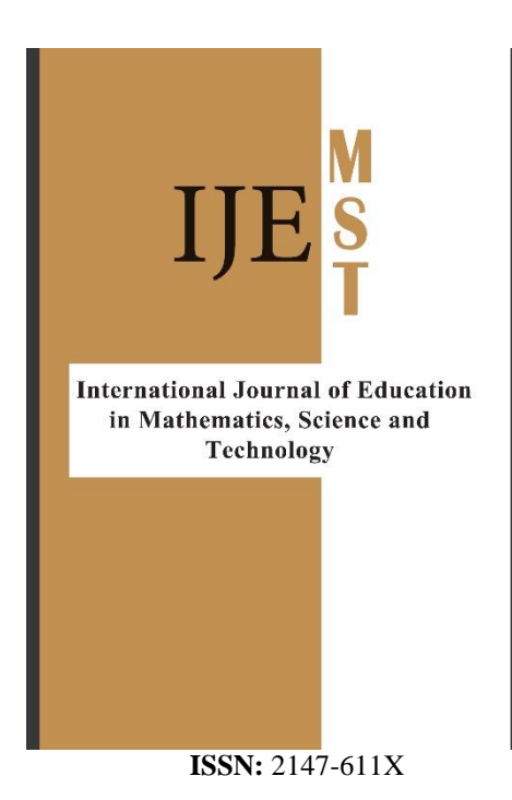
International Journal of Education in Mathematics, Science and Technology (IJEMST)